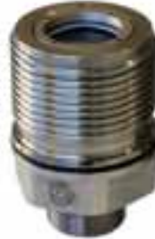
Clean break coupling series CH