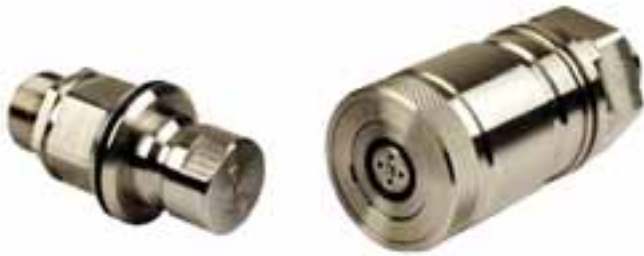
Clean break couplings series HP