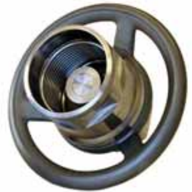
Screw type couplings series CH