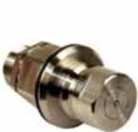
HC-G12-Z11 with pressure vent

By adding some components the ingress of dirt and contamination into the locking mechanism is prevented. This system has proved itself especially usefull in steel mill environment