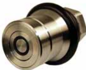
HC-G12-Z12 with componets for dirt protection