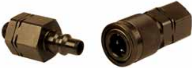
High pressure couplings series HP